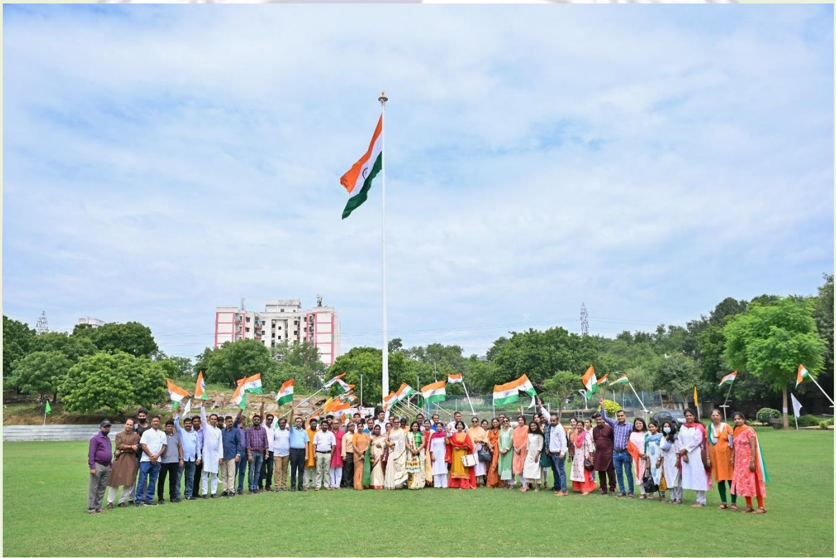
All right goes to Motilal Nehru College (Day) (University of Delhi)